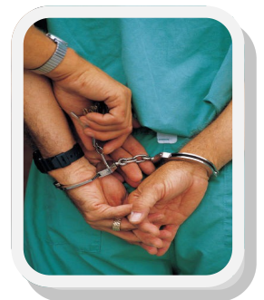
Manager sentenced after ICE I-9 audit.

During sentencing the U.S. District Judge stated that the immigration laws must be respected and enforced.